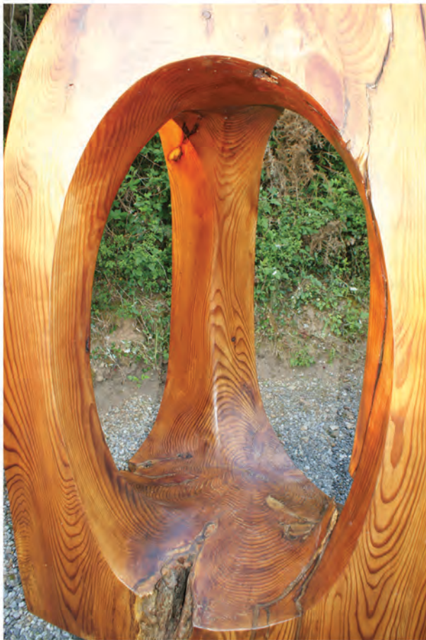
Enfolding Presence Integritas

We are enfolded in the Father, in the Son and in the Holy Spirit. And the Father, the Son and the Holy Spirit are enfolded in us: all-mighty, all-wisdom, all-goodness, one God, one Lord.