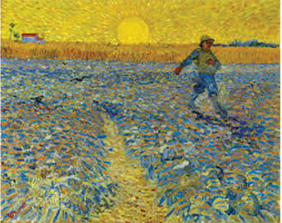
Sower with Setting Sun Vincent Van Gogh

As for the part in the rich soil, this is people with a noble and generous heart who have heard the word and take it to themselves and yield a harvest through their perseverance.