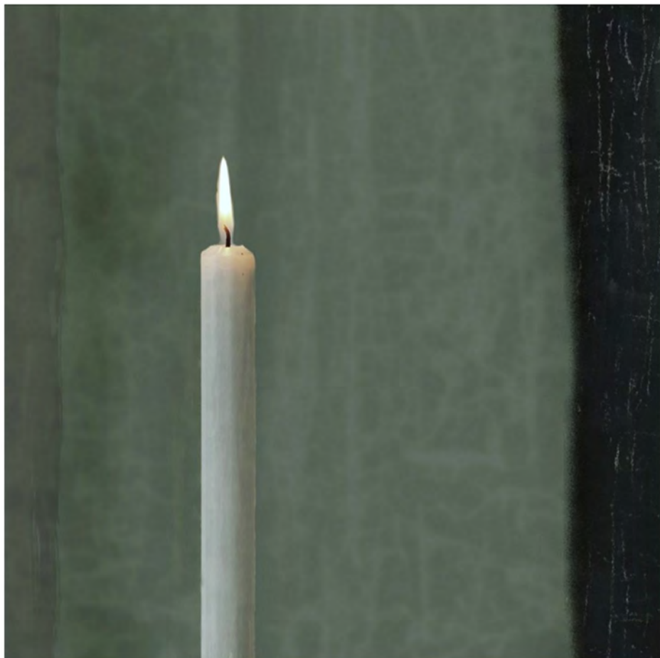
Candle Gerhard Richter

This is the unique feature of human beings: their desire is greater than the infinite universe.