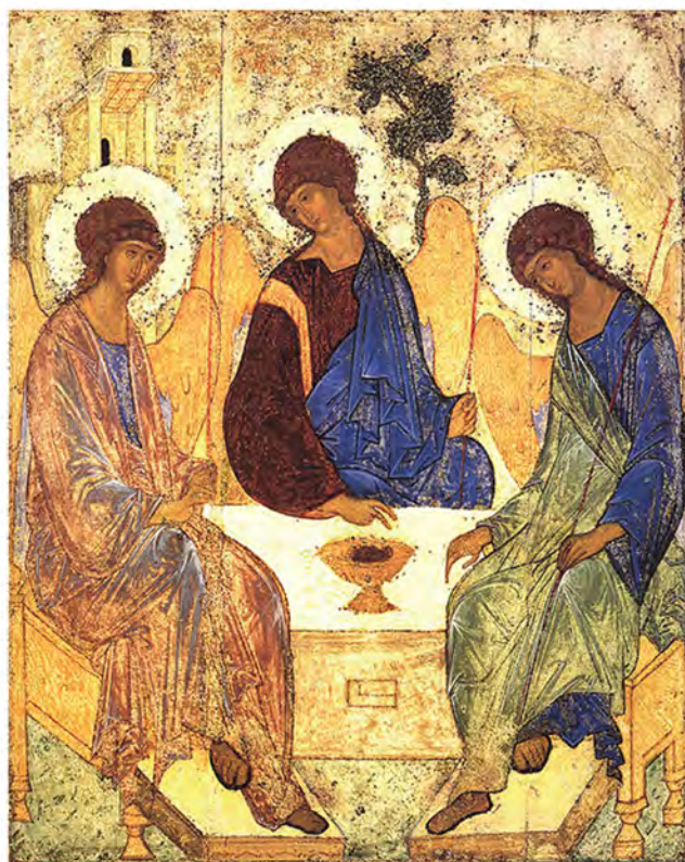
Trinity Andrei Rublev

If truth is disconnected, if it is not relationship, you do not understand. As Pope Francis wrote to Eugenio Scalfari: “Truth, according to the Christian faith, is the love of God for us in Christ. Therefore, truth is a relationship.”