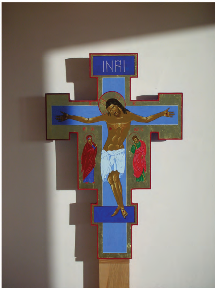
The Icon of the Crucifixion Integritas

And I, when I am lifted up from the earth, will draw all people to myself. John 12:32